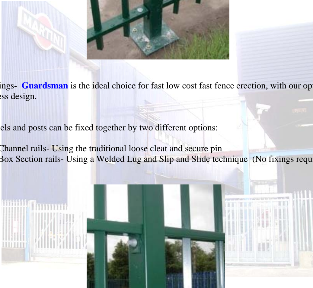
Secured with Optional Fixing Choice "A"

Guardsman is available with a compliment of matching manual and automatic gates to match the chosen specification. Choose from our popular vehicle or pedestrian range with a choice of locking options.